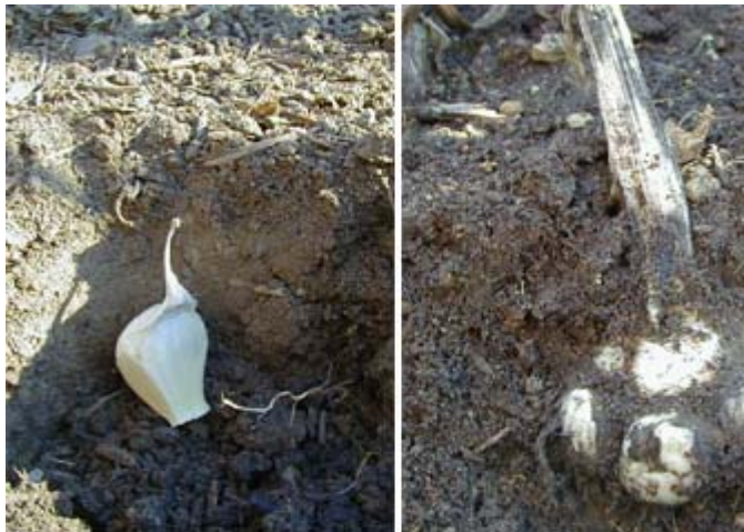
Plant garlic cloves in fall to produce a harvest of bulbs the following summer.

The amount of garlic to purchase will depend on the area to be planted and variety (certain varieties have more plantable cloves per bulb than others). Generally, there